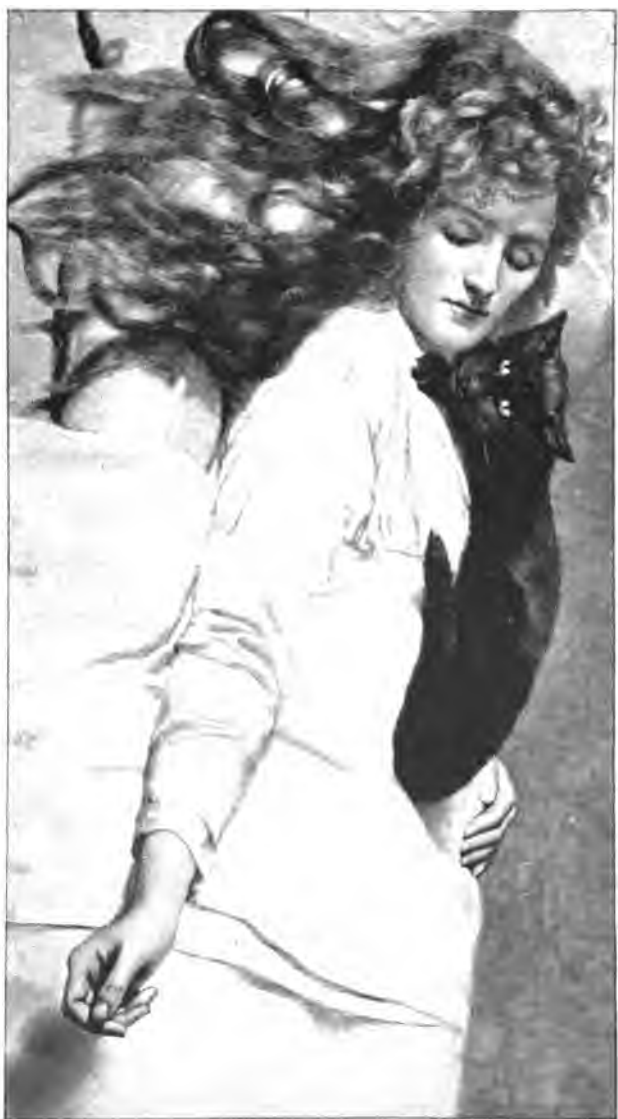
THE STREET OF THE FOUR WINDS