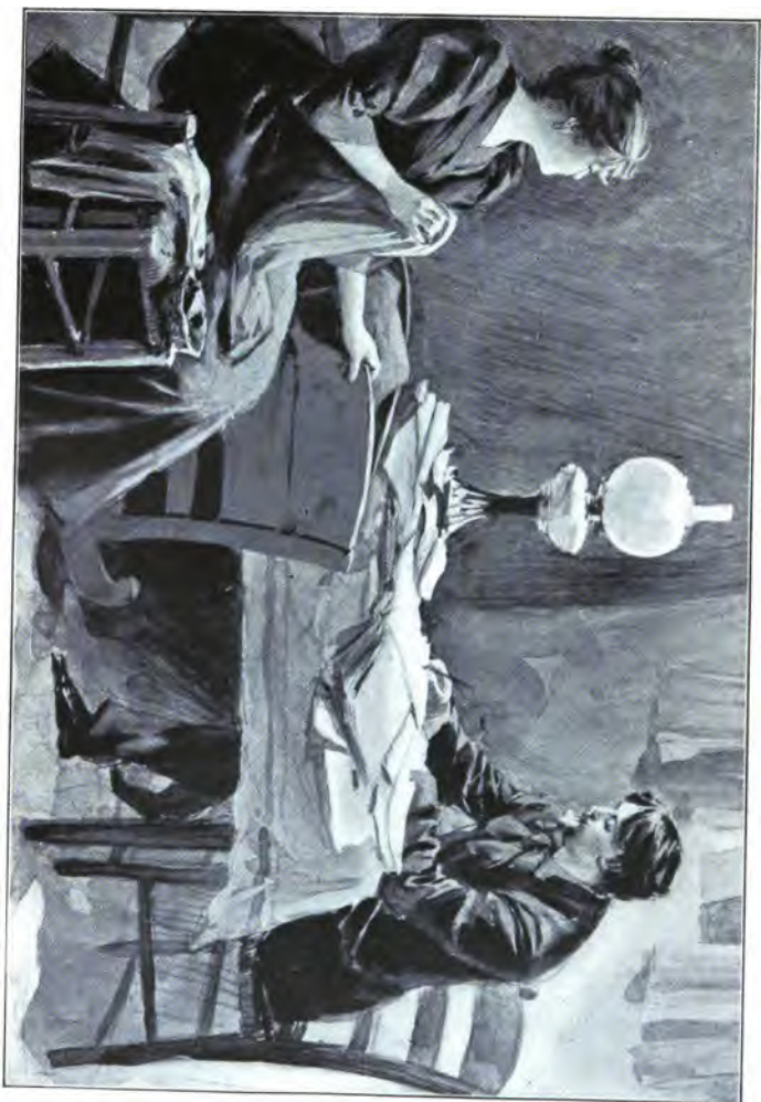
"HIS ALL, IN LIFE."